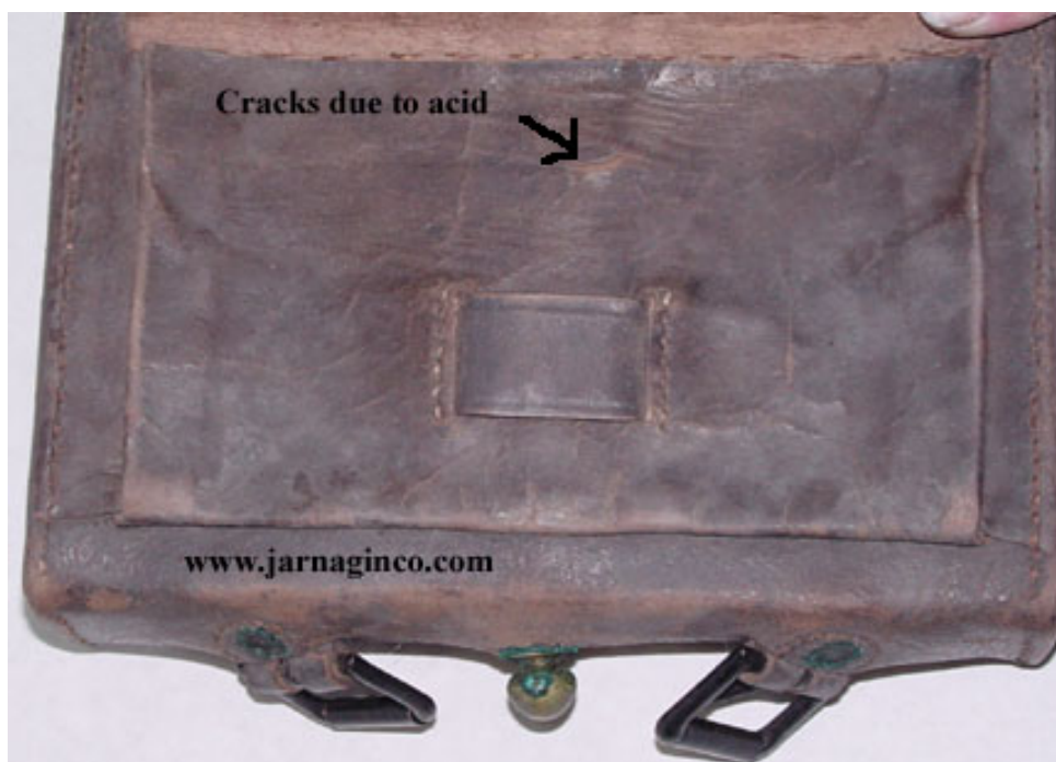
Figure 3: Hemlock tanned Watertown Arsenal cartridge box. Note cracks in leather due to acid damage.

There was another type of tanning process that should be mentioned- "Union-tanned" leather or "mixed" tannage. This method used a combination of both hemlock and oak bark as a tanning agent. The tanners of the time believed mixing hemlock and oak barks would produce leather of better quality than either bark by itself. Ratios of hemlock and oak barks would vary but leather produced in this manner apparently still had fading problems inherent with hemlock and were thus not acceptable to the Federal government. 8. In December 1863, 546 cartridge boxes manufactured by contractor James Boyd were rejected as being made of mixed tanned leather. Boyd wrote to George D Ramsay, Chief of Ordnance in an attempt to get the cartridge boxes accepted anyway by arguing the difficulties of maintaining a supply of oak tannage.