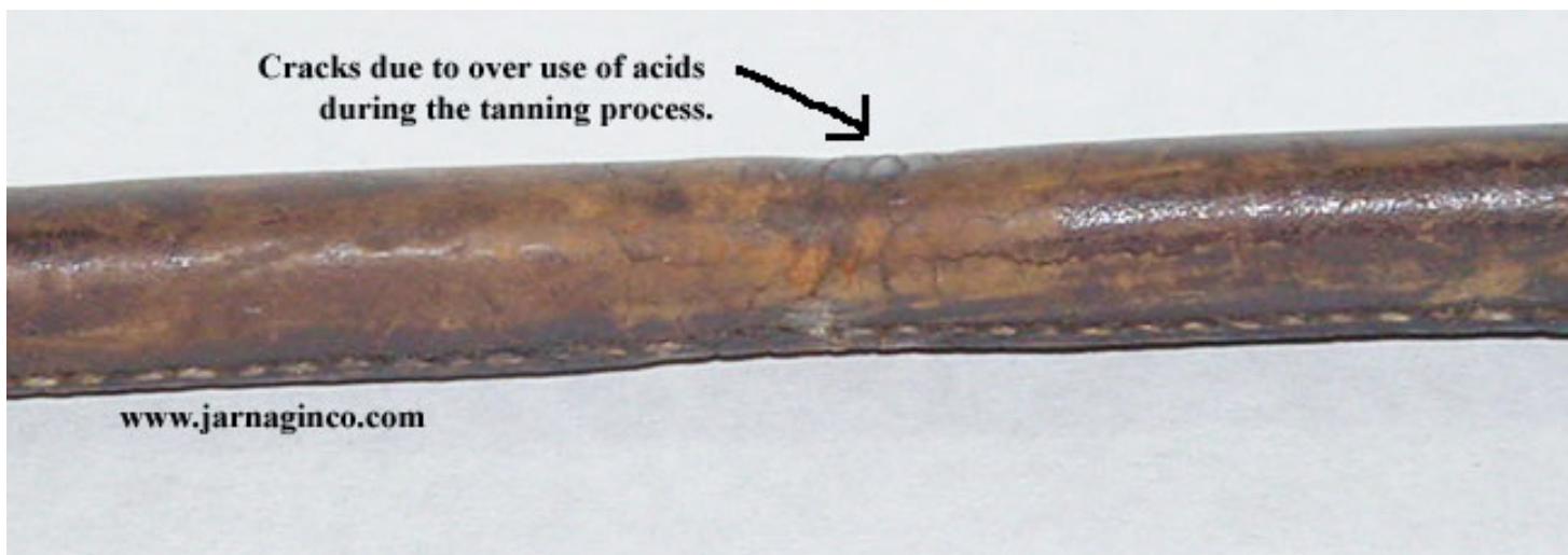
Figures 2A & B. Hemlock tanned 1859 pattern two rivet bayonet scabbard. Note acid damage in bottom photo.