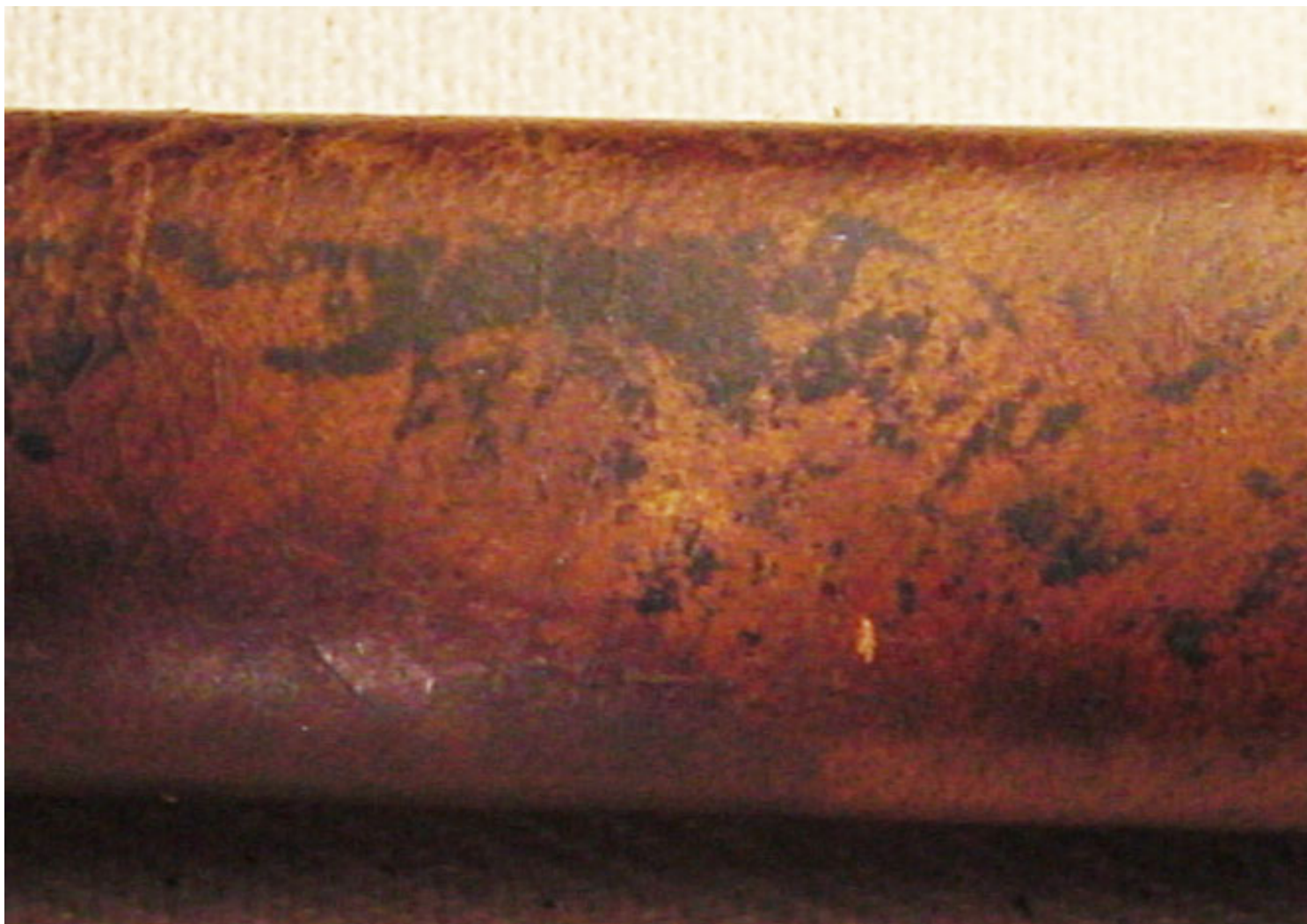
Figure 5: Close up of a hemlock tanned pattern of 1859 bayonet scabbard with what’s left of lamp black finish applied to the grain surface. The remains of this type of finish give it a 3-D appearance.

There is strong evidence of a second way that tanners blackened leather at the time of the Civil War. Most leather dyes were used on the grain side or smooth of the hide. However, this second type called “waxed” used common lamp black that was worked into the flesh or rough side of the leather. Waxing actually works quite well because the rough surface gives greater adherence to the lampblack. 12. Nevertheless, unscrupulous contract tanners would often wax hemlock tanned leather on the smooth side of the leather giving it the black appearance it needed to pass inspection. This apparently fooled the inspectors- at least temporarily. Unfortunately, as the finish wears off the lamp black returns to powder and falls off giving the leather a patchy, three-dimensional look. At first, this erroneous dye treatment was thought to be rare during the war however, after examination by the author of over one hundred artifacts a large quantity show this type of finish suggesting that it may have been a fairly common finish for hemlock tanned leather. (Insert Figure 5)