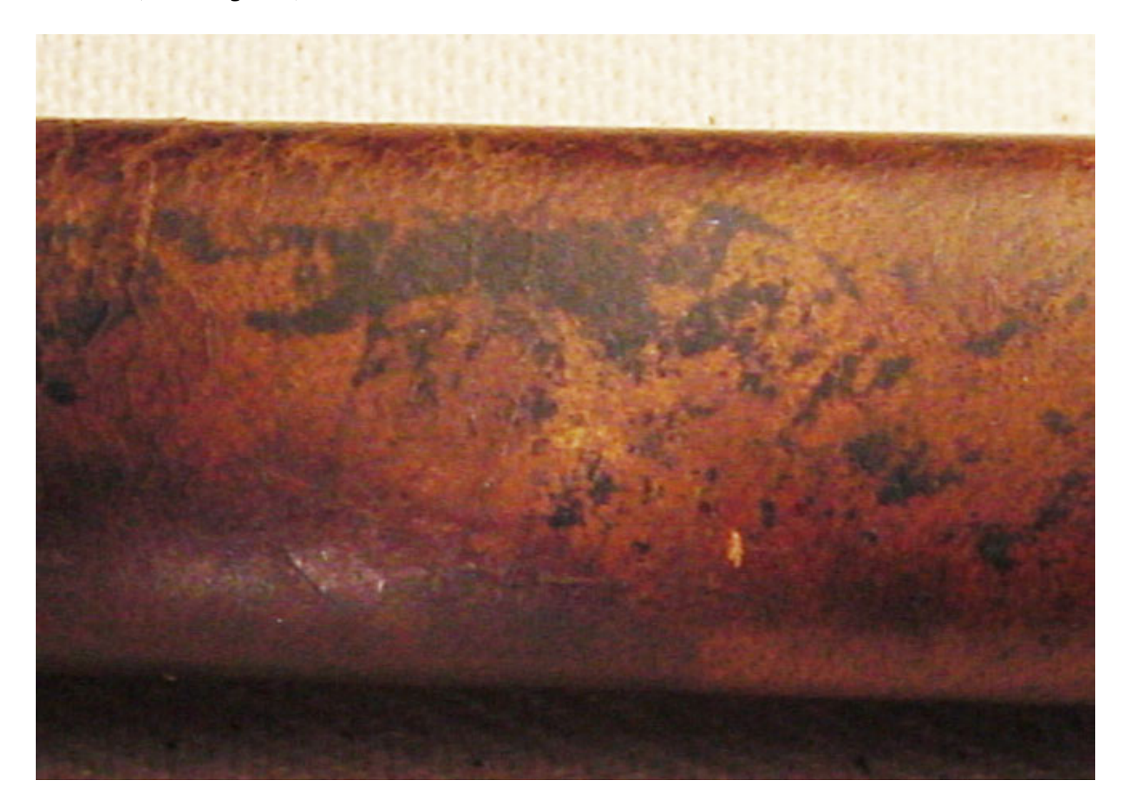
Figure 5: Close up of a hemlock tanned pattern of 1859 bayonet scabbard with what's left of lamp black finish applied to the grain surface. The remains of this type of finish give it a 3-D appearance.

There is strong evidence of a second way that tanners blackened leather at the time of the Civil War. Most leather dyes were used on the grain side or smooth of the hide. However, this second type called "waxed" used common lamp black that was worked into the flesh or rough side of the leather. Waxing actually works quite well because the rough surface gives greater adherence to the lampblack. 12. Nevertheless, unscrupulous contract tanners would often wax hemlock tanned leather on the smooth side of the leather giving it the black appearance it needed to pass inspection. This apparently fooled the inspectorsat least temporarily. Unfortunately, as the finish wears off the lamp black returns to powder and falls off giving the leather a patchy, three-dimensional look. At first, this erroneous dye treatment was thought to be rare during the war however, after examination by the author of over one hundred artifacts a large quantity show this type of finish suggesting that it may have been a fairly common finish for hemlock tanned leather. (Insert Figure 5)