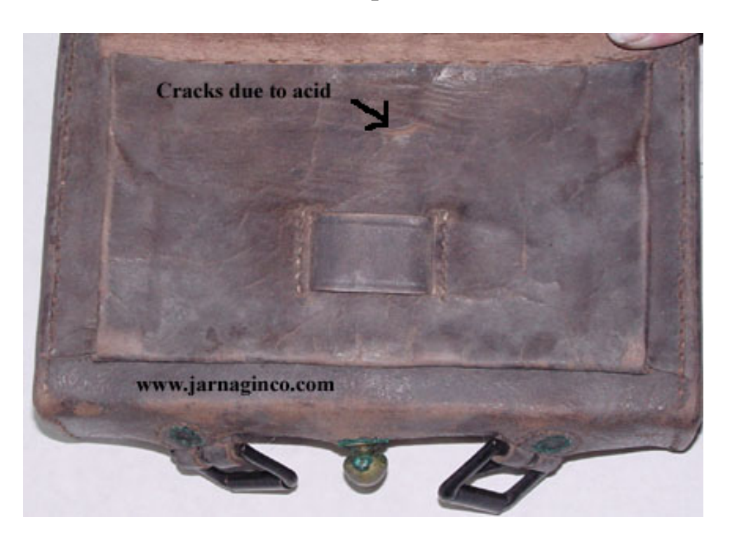
Figure 3: Hemlock tanned Watertown Arsenal cartridge box. Note cracks in leather due to acid damage.

There was another type of tanning process that should be mentioned- "Union-tanned" leather or "mixed" tannage. This method used a combination of both hemlock and oak bark as a tanning agent. The tanners of the time believed mixing hemlock and oak barks would produce leather of better quality than either bark by itself. Ratios of hemlock and oak barks would vary but leather produced in this manner apparently still had fading problems inherent with hemlock and were thus not acceptable to the Federal government. 8. In December 1863, 546 cartridge boxes manufactured by contractor James Boyd were rejected as being made of mixed tanned leather. Boyd wrote to George D Ramsay, Chief of Ordnance in an attempt to get the cartridge boxes accepted anyway by arguing the difficulties of maintaining a supply of oak tannage.