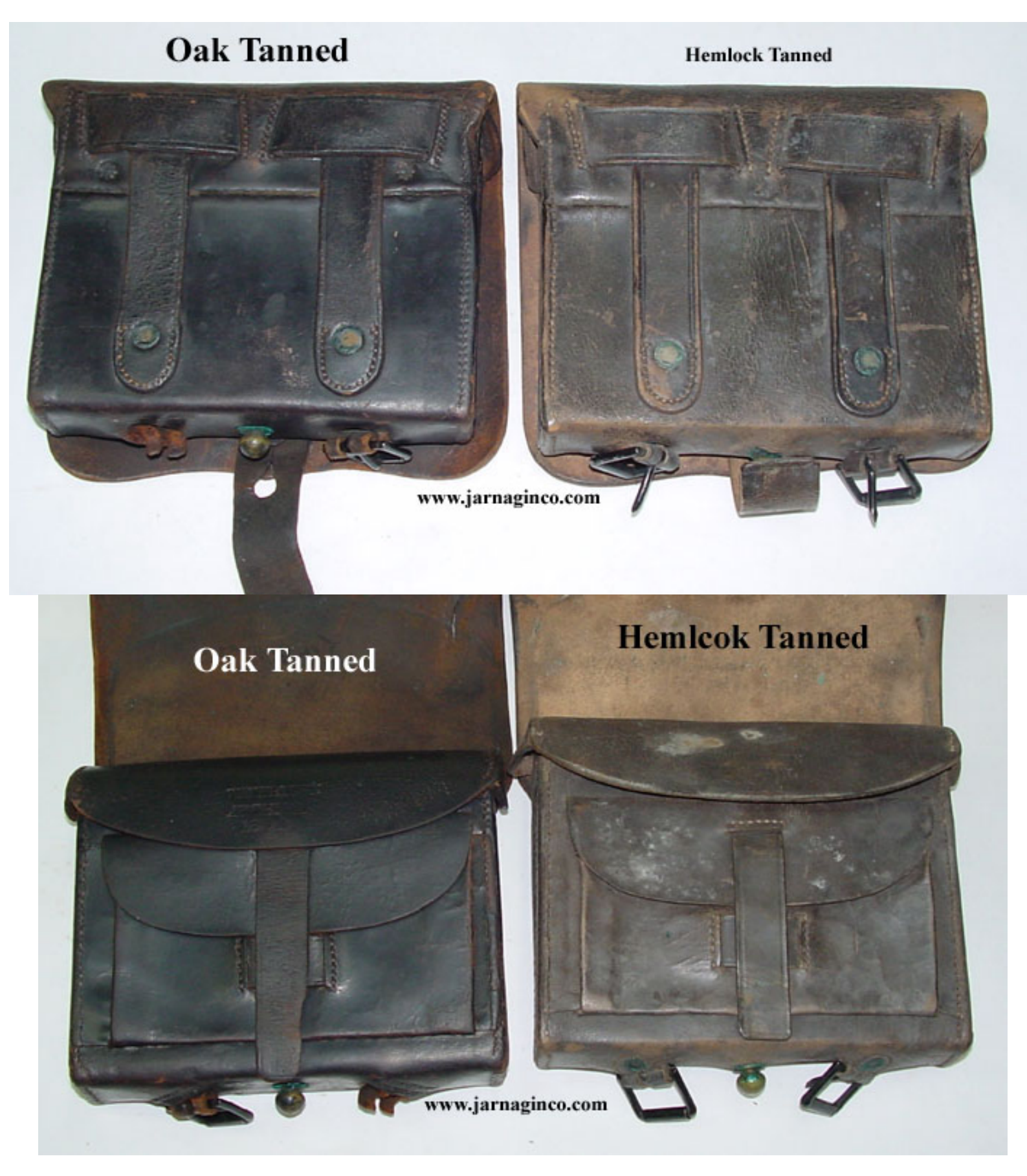
Figure 6: Photos of two 1864 dated Watertown Arsenal cartridge boxes side by side. The box on the left is Chestnut Oak tanned and still retains its dark black dye finish. The one on right is Hemlock tanned that has turned its signature brown. Fading on Hemlock leather will result regardless of the