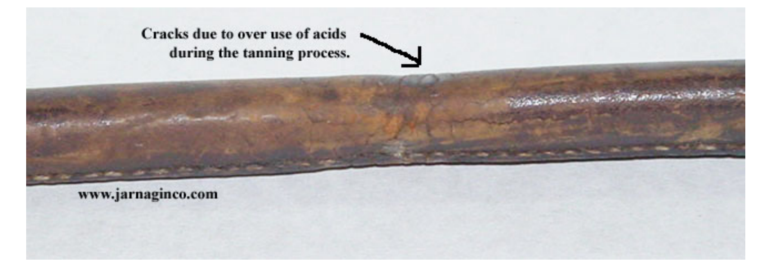
Figures 2A & B. Hemlock tanned 1859 pattern two rivet bayonet scabbard. Note acid damage in bottom photo.